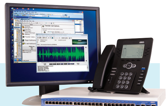
NetVanta Unified Communications System— NetVanta 7100 and IP Phone